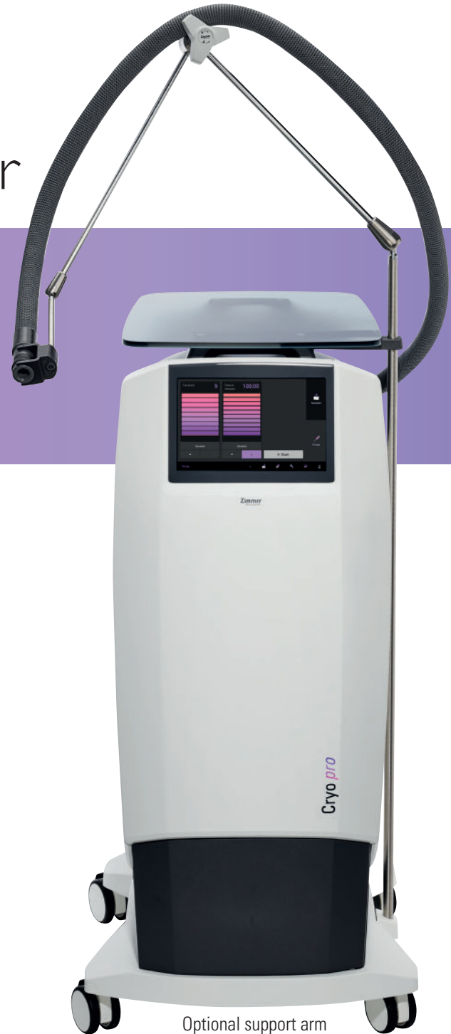
Optional support arm Description valid for the Cryo 7 variant

With its UV module, the new Cryo pro minimises germs in the cold air. It also features an improved air filter which already ensures significantly fewer particles in the aspirated air. As a result, the new cryotherapy device significantly improves hygiene during each laser application.