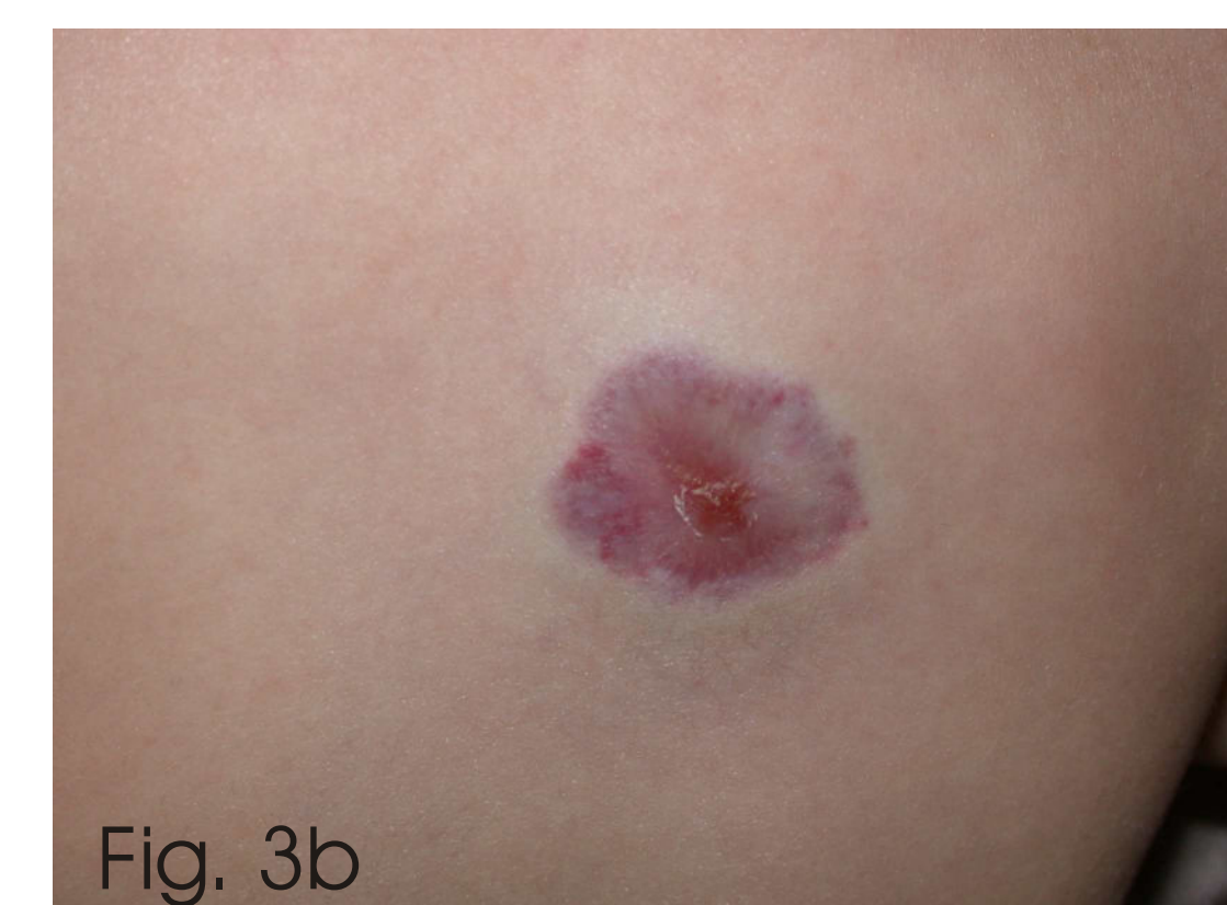
Fig 3 a,b: Patient number 6 (16/11/00; age at first treatment: 4 months, female), localization on back (scapular) ; size of 53mm, 4 sessions at 2 weeks to 2 months intervals.