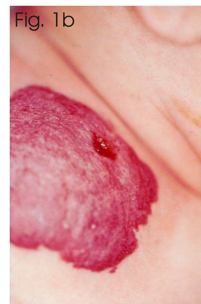
Fig 1a,b : Patient number 7 (22/11/00; age at first treatment: 2,5 months/ female), localization right shoulder; size of 38 mm, 2 sessions at 3 weeks intervals.