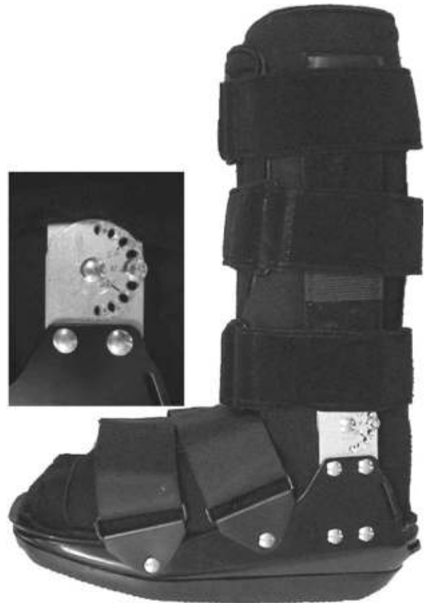
Fig. 1: The modified Bledsoe Diabetic Conformer Walking Boot used in the study. The small insert picture demonstrates the ankle adjustment mechanism.

Custom-modified walking boots from Bledsoe Brace Systems (Grand Prairie, TX) were used in this study. The company's standard Conformer Diabetic Walking Boot was modified to allow an adjustable ankle angle. A hinge was added at the bottom of the upright supports of the boot to allow it to be set at various degrees of plantarflexion and dorsiflexion, in 2.5° increments (see Fig. 1). For this study, subjects were tested in three conditions: the standard neutral angle of a 90° angle between the foot and the tibia, 5° of plantarflexion, and 5° of dorsiflexion.