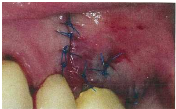
Fig. 8: Situation immediately after completion of the