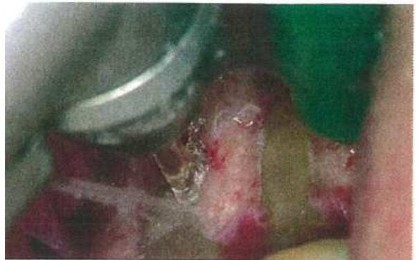
Fig. 6: Resection of the root point with the Er:YAG laser.