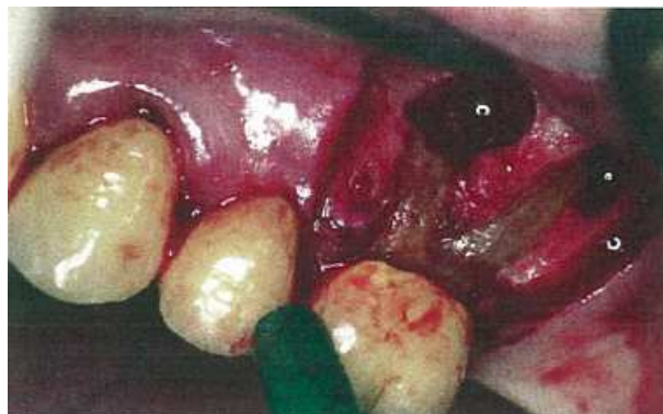
Fig. 7: Removal of the granulated tissue with the Er:YAG laser; subsequent germ reduction in the depth of the bone or the resection cavity performed using the Nd:YAG laser.