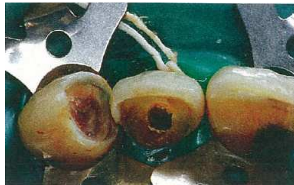
Fig. 1: Representation of the channel entrance of tooth 12

may also be an option although high transmission is achieved due to its higher absorption in water. This explains why this laser source, especially at a depth of 1.000µm, can only achieve 30% to 40% germ reduction.