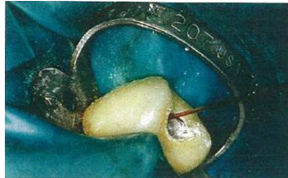
Fig. 2: Nd:YAG fiber inserted the root canal of tooth 24

All other wavelengths such as Er:YAG, Er,Cr:YSGG and CO 2 lasers are not applicable in endodontics. Their absorption in hydroxyapatite and water is so high that germ reduction would predominantly only take place in the main canal, although germ reduction through thermal effects can still be detected in the lateral dentinal tubuli up to depths of 300µm to 400µm. These wavelengths are not very suitable for endodontic treatments. Er:YAG and Er,Cr:YSGG lasers can however be successfully used to remove organic tissue and smearlayers.