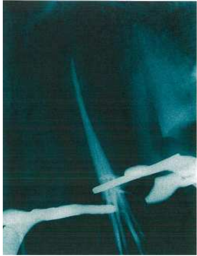
Fig. 4: Situation after root filling of tooth 12.