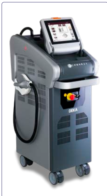
Figure 1. Schwarzy system.

Excess weight and localized adiposity are problems that affect a large number of people in both sexes (about 80%). The problem, however, is that -as far as noninvasive protocols are concerned, interaction with muscular mass become of primary importance. An original approach is the one proposed from Schwarzy by DEKA: a system with FMS (Focused Magnetic Stimulation) Technology dedicated to body firming with stimulation of the muscular mass. The non-invasive device acts on different body areas thanks to its paddle handpiece that you adapt