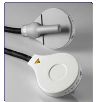
Figure 2. Schwarzy paddle handpieces.

“What patients are mostly requesting for - Dr. Incandela says - is whether it is possible to lose weight and