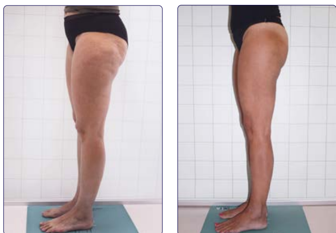
Figure 4. Before and after pictures following a combined treatment with Schwarzzy and Onda systems. There is a reduction in fat and a more toned muscles, as well as the general improvement of texture and cellulite.

The treated area becomes more toned. It's possible start perceiving tangible results right away after treatment, however, the best results they are observed for two to four weeks after the last session and continue to improve for several weeks after