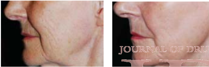
FIGURE 4. A 66-year-old, skin type 2 female at baseline (left); 3 months following one treatment with the Ellipse® Juvia CO 2 laser (right)

The authors know from experience from ablative resurfacing that off-face treatments have a higher tendency to scar. The jury is still out on the safety profile of treating off-face with fractional ablative devices. Will there be any delayed onset hypopigmentation, for example? The authors will continue to watch the complication rates closely and what parameters may be associated with scarring.