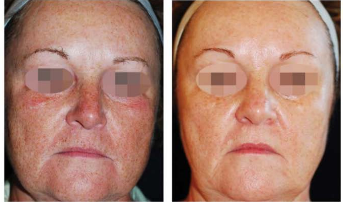
FIGURE 3. A 55-year-old, skin type 2 female at baseline (left); 3 months following one treatment with the Alma Pixel® XL Harmony Er:YAG laser (right)

ablation and thermal damage are needed to stimulate maximal neocollagenesis.