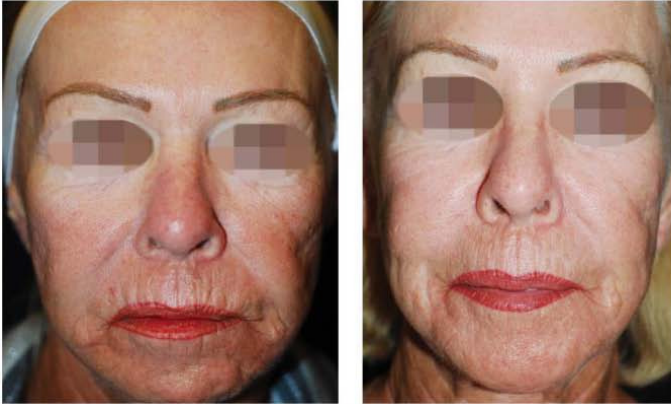
FIGURE 2. A 70-year-old, skin type 2 female at baseline (left); 3 months following one treatment with the Fraxel re:pair® fractional ablative CO 2 laser (right)

coagulation with erbium lasers, these devices yield increased bleeding post-operatively. In addition, there was concern that the “hot” holes of the CO 2 devices may cause too much thermal damage and lead to possible scarring, and even melanocyte damage, in years to come. In this small patient group, the CO 2 lasers exhibited results that were superior to those of the erbium lasers in rhytids. The erbium technology fared better with hyperpigmentation.