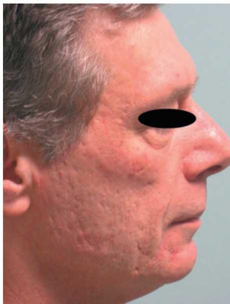
Figure 3 Patient with acne scar and photoaging.