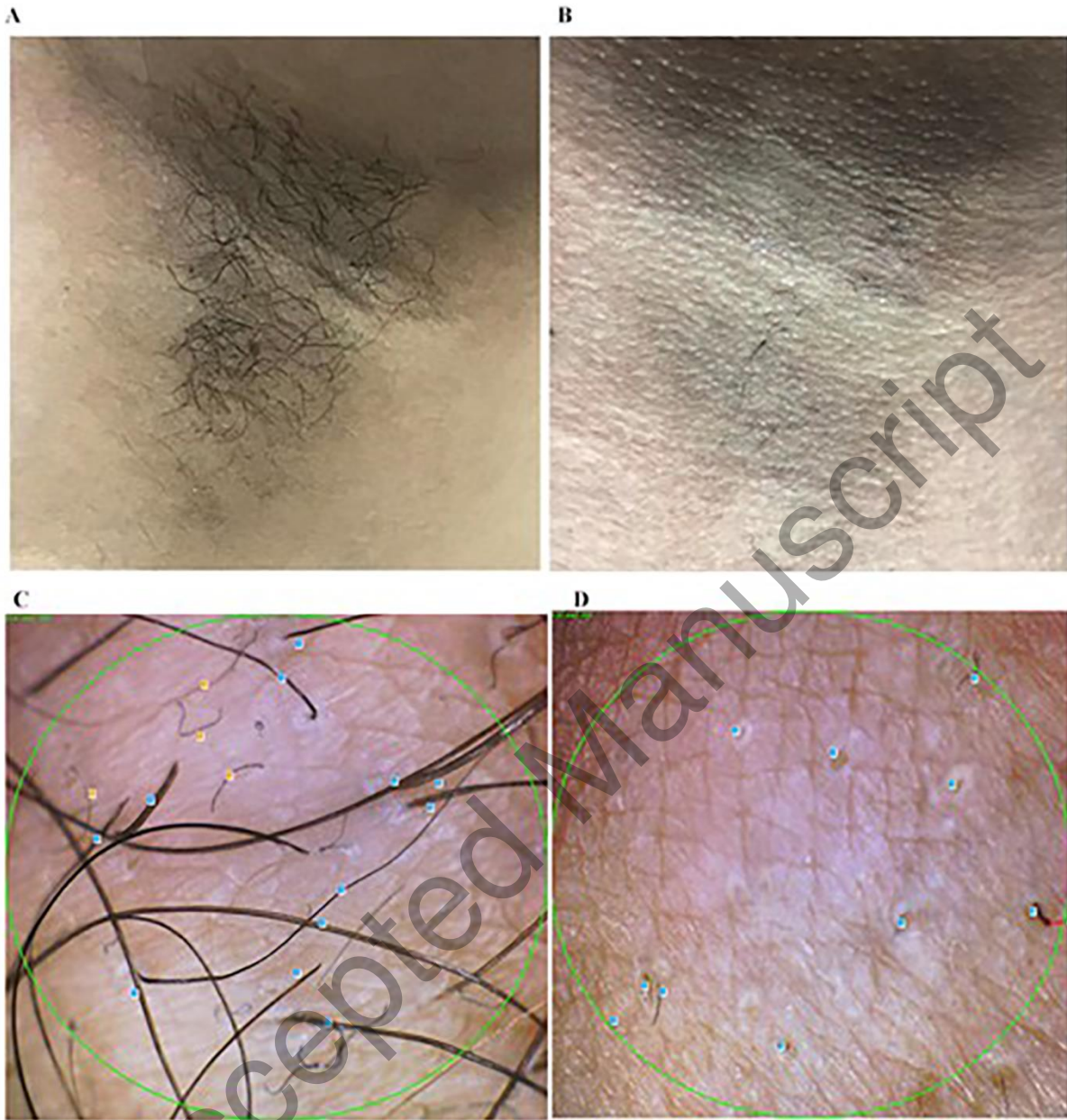
Figure 2. Female patient aged 20 years (the same patient). Multipass Alex laser-treated side. The clinical picture at baseline (A) and 1 month after the 5th laser session (B). Dermoscopy picture at baseline (C) and 1 months after the 5th laser session (D).