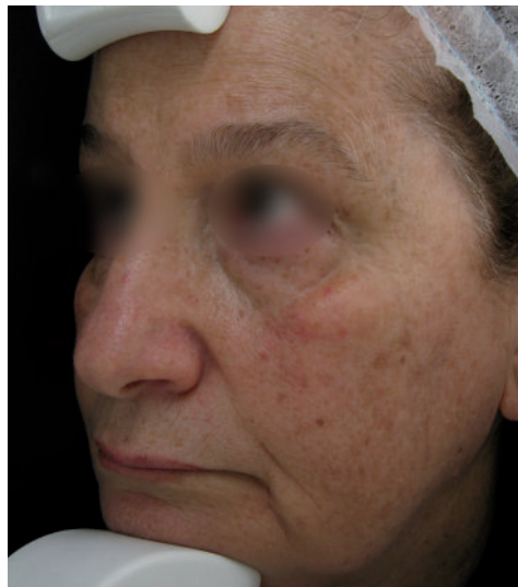
One week after the 2 nd treatment