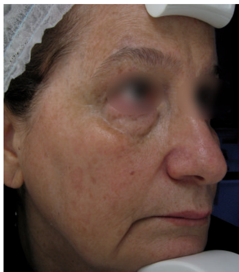
One week after the 2 nd treatment