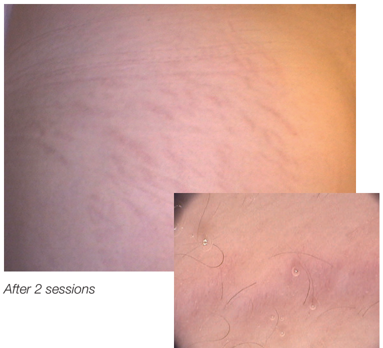
After 2 sessions