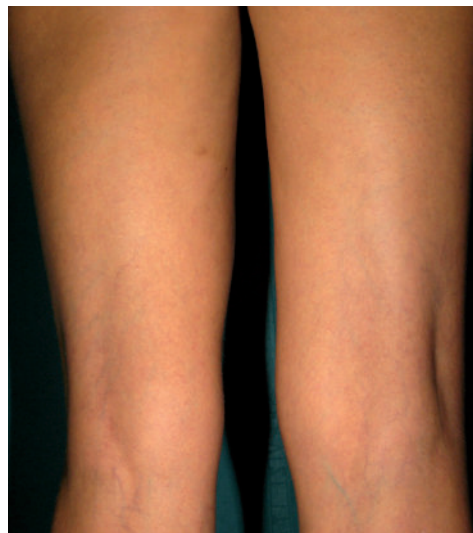
Five months after the 6 th treatment (picture taken using polarized light)