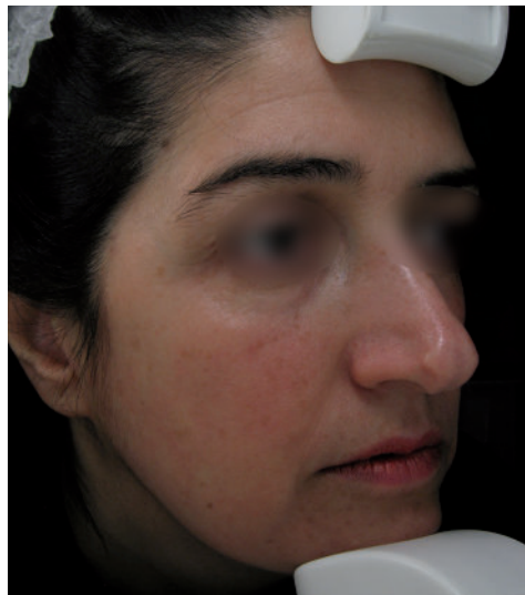
One week after the 3 rd treatment