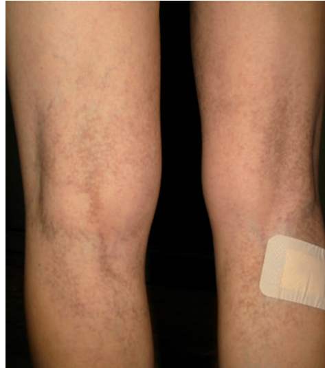
Before the treatment (picture taken using polarized light)