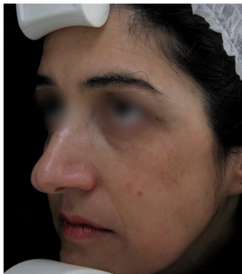
One week after the 3 rd treatment