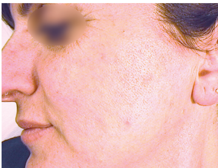
After 2 sessions

Courtesy of: G. Cesare, MD Dermatologist Naples, Italy