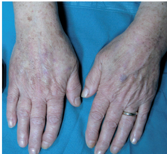
One month after the 3 rd treatment