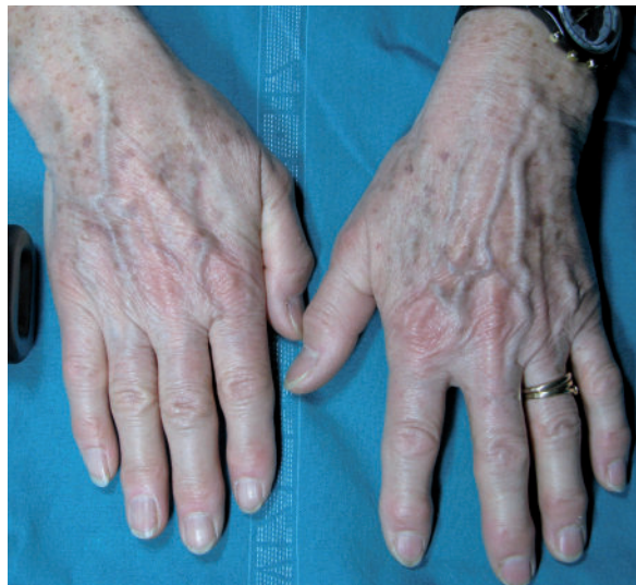
One month after the 4 th treatment