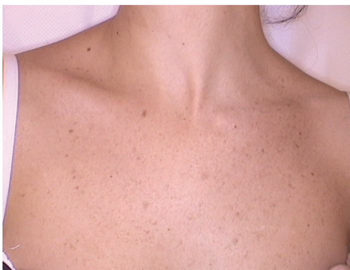
After 1 session