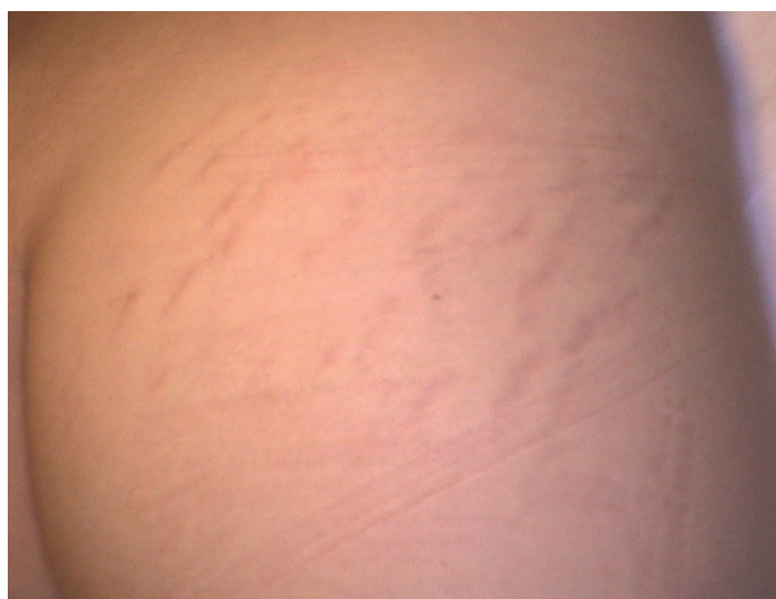
After 2 sessions