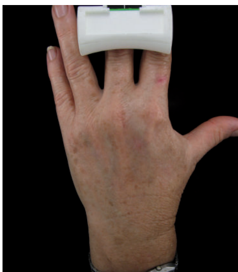
One week after the 3 rd treatment