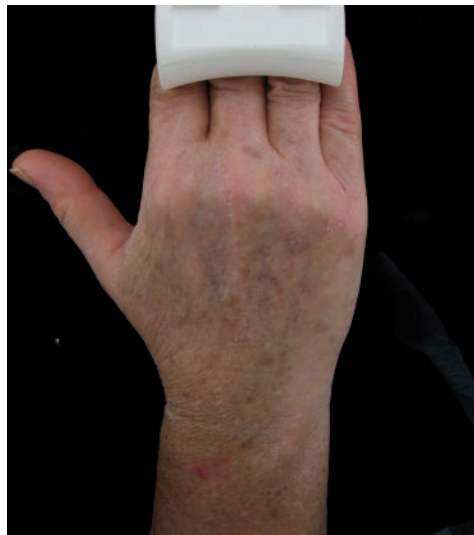
One week after the 3 rd treatment