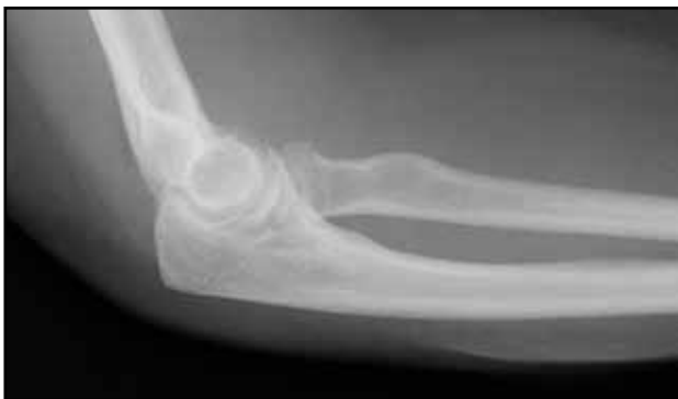
FIGURE 1: Preoperative X-ray