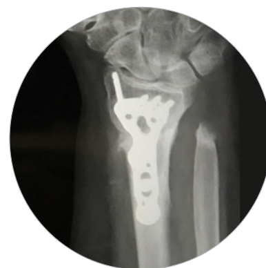
6 weeks postoperative

Postoperatively, the patient was placed in a nonremovable wrist splint, followed by a removable wrist splint with gentle ROM instructions beginning at 10 days. At a six-week follow-up, X-rays confirmed osseous union. The patient reported significant improvement from preoperative pain, and her wrist flexion/extension was 40/40. The patient was referred to hand therapy to maximize range of motion.