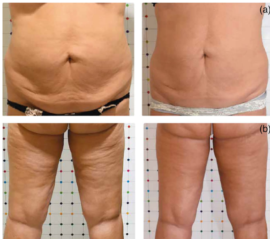
FIGURE 1 (a) Abdominal adiposity in a 46-year-old female patient before and 4 weeks after Onda system treatment; (b) Trochanteric adiposities in a 54-year-old female patient before and 4 weeks after Onda system treatment